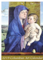
2019 Columban Art Calendar

are now available for purchase at the St Patrick's and St John Vianney's Our Piety Stalls are open following 9:00am Mass (Parkdale) and from 10:30am (Mentone).